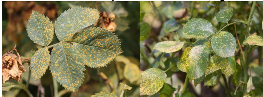
Fig. 3. Rust (caused by Phragmidium mucronatum ) on rose foliage. The erumpent pustules form on the lower surface of leaves, and these produce the orange rust spores

Yellow rust is a common disease of wild and garden roses. Agents of rose rust are monoecious, that is, the entire cycle of their development takes place on rose plants. Pathology causes significant damage to rose plants, causing the twisting and drying of shoots, drying of leaves and bushes, delayed growth and development, and also significantly reduces the decorative qualities of varieties (Fig. 3).