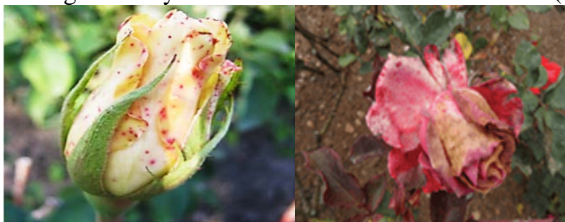
Fig. 4. Botrytis blight (caused by Botrytis cinerea ) on a rose flower. The fungus will produce gray-brown fungal growth with spores on the petals

Botrytis blight roses (gray mold). Pathology caused by the pathogen Botrytis cinerea was detected on buds and flowers and very rarely on stems and leaves. Brown spots develop on the affected tissues. In humid weather, the spots are covered with a dense gray coating of the fungus and rot (soft rot), in low humidity conditions, they dry out. The buds do not open or they form deformed flowers. There are small brown spots or sores on the petals. With a high degree of damage, the flowers dry up, deform, lose their color and rebloom within a day, while the petals often do not fall but hang down, which significantly reduces the decorativeness of roses (Fig. 4).