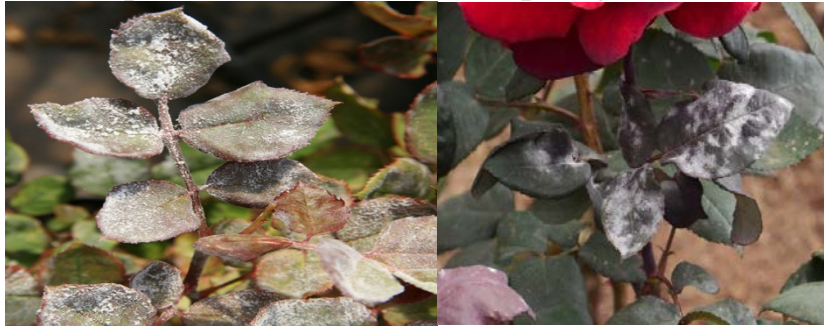
Fig. 1. Powdery mildew (caused by Sphaerotheca pannosa var. rosae ) on rose foliage

in the form of mycelium on the affected shoots. The primary source of rose infection is conidia on the wintering mycelium. Pathogen of Sphaerotheca pannosa Lev. var. rosae Woronich. develops on all aerial parts of the plant, but most strongly on young shoots. The disease causes a general weakening of plants due to a decrease in the photosynthetic surface (the appearance of dense mycelial plaque on the leaf epidermis, curling of leaves, premature drying), and a decrease in the decorative qualities of varieties. Powdery mildew-resistant roses with leathery glossy leaves, the most susceptible varieties with large leaves, dark-colored varieties of roses [3, 5]. Leaf damage occurs from the bottom to the top (up to 5–6 leaves). Old leaves are not affected by powdery mildew. The initial manifestation of the disease on the leaves is noted in the form of a white powdery coating, which quickly becomes powdery. The leaves are deformed. The pathogen causes thickening and ugliness of young shoots and buds. Severely affected leaves turn brown, dry and fall prematurely. Affected plants lag behind in growth, shoots are twisted, leaves are deformed and twisted upwards, buds do not open, flowers do not develop (Fig. 1).