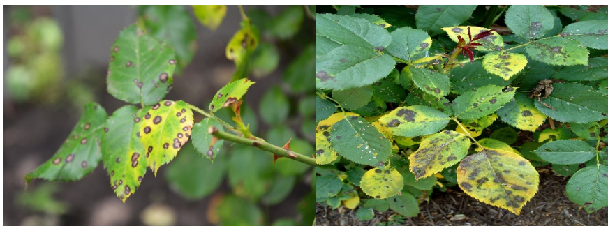
Fig. 2. Black spot (caused by Diplocarpon rosae ) of rose

With severe damage, rose bushes are completely exposed. Black spot damage does not affect flowering in this growing season, but has a negative effect on the amount of nutrients with which plants leave for the winter, on the formation and number of flower buds, on the maturation of shoots. In the next growing season, the growth of shoots and flowering productivity decrease sharply. Affected plants are less resistant to adverse factors. The harmfulness of the disease consists in premature death of leaves, leaf fall (defoliation), general weakening of plants, death of susceptible plants, reduction of decorativeness and resistance to adverse conditions. By the third decade of August or the beginning of September, the affected rose bushes become bare and the plants resume growth due to axillary buds. In winter, such bushes freeze strongly, weaken, which contributes to their secondary damage